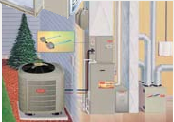
HYBRID HEAT® Deluxe Heat Pump and Deluxe Gas Furnace System